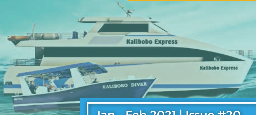
Picture: The Kalibobo Express & Kalibobo Diver