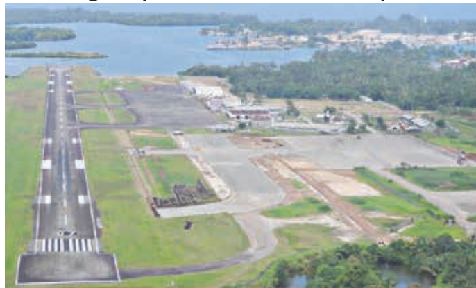
An aerial picture of the airport showing the recent upgrade. The planned airport has undergone its first phase of upgrade.