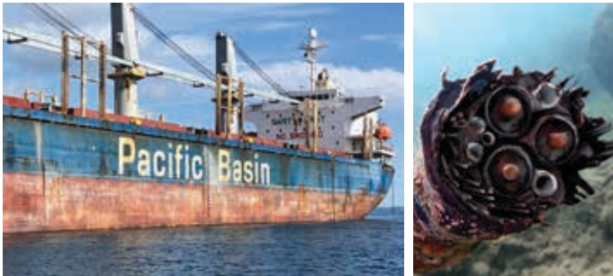
The ship and a picture of an older submarine cable.

On Sunday the 10th of January, an Asian logging ship recently entered the Madang harbor allegedly causing a power outage to Krangket Island.