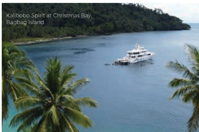
Kalibobo Spirit at Christmas Bay, Bagabag Island.