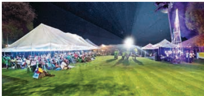
The Christmas Pageant at the Madang Resort's Sugen Aben Park.

More than 2,000 people attended the Christmas Pageant that was sponsored by the Madang Resort and the Madang Rotary Club at Sugen Aben Park on Saturday the 19th.